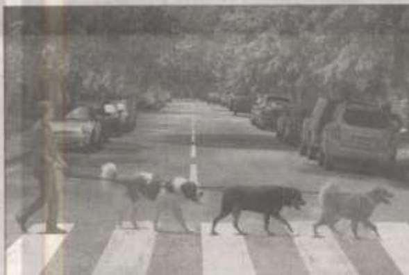
'LETTING GO' : Jake Torem wrote, directed and stars in the film about a man coming to grips with a family tragedy.

This year the festival includes about 100 films, including features,